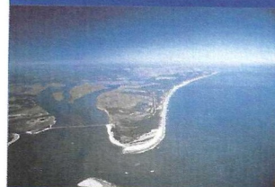
Aerial view of Amelia Island