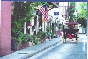
Historic St. George St