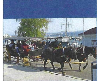
Tour Mackinac Island by Horse and Carriage

Diamond Tours ® inc. Bringing Group Travel to a Higher Standard ®