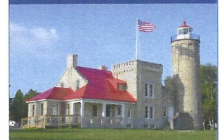
Mackinac Point Lighthouse