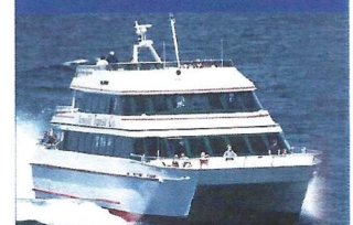
Mackinac Island Ferry