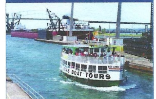
Soo Locks Cruise in Sault Sainte Marie