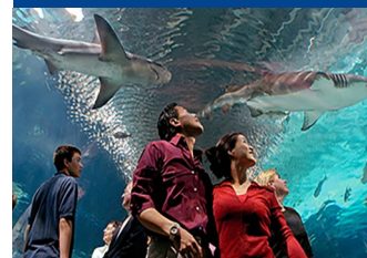
Incredible Creatures at Newport Aquarium

Departure: Indiana Welcome Center, 7770 Corinne Dr, Hammond, IN @ 8 am