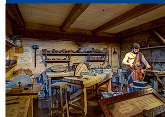
View from Inside the Ark Encounter