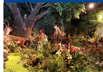
Visit to the Amazing Creation Museum!