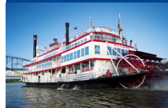
Enjoy a BB Riverboats Sightseeing Cruise