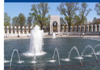
World War II Memorial