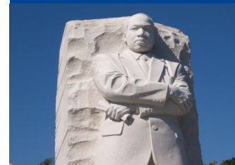
Martin Luther King, Jr. National Memorial