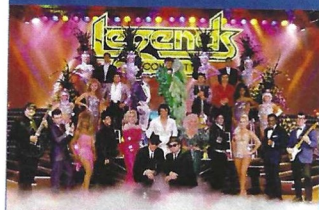
Exciting Legends in Concert