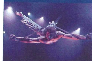
Le Grand Cirque