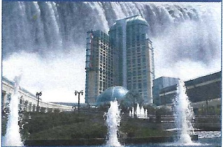
Gaming at Fallsview Casino