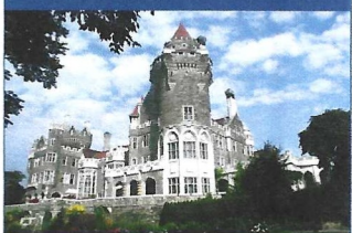
Magnificent Casa Loma Castle in Toronto