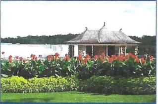
Visit beautiful Queen Victoria Park